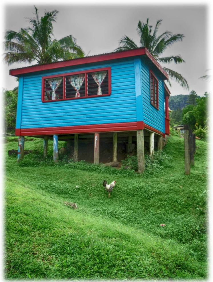
Back at Abaca Village, we present our Yagona and then gather the mechanics together to help fix the tire.