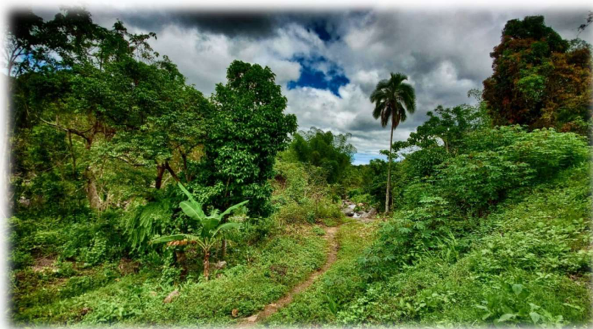
Future pit crew, beautiful view down the valley and a dalo patch.